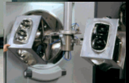
Automatic, ergonomic loading of fixtures into the Press-Side® 3000 Rapid Cycle Metalizer